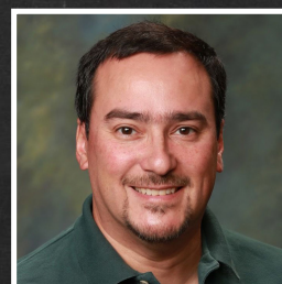
John Palmer Water

If you would like to book one of our vendor stands, please submit your request to: viktor.ottosson@tasteevents.se Price per vendor stand: SEK 9 995 (approx 900 €), VAT excluded.